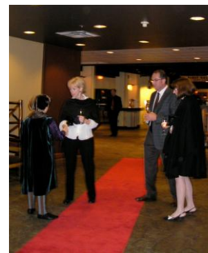
into Hair and Make-Up.....onto the red carpet